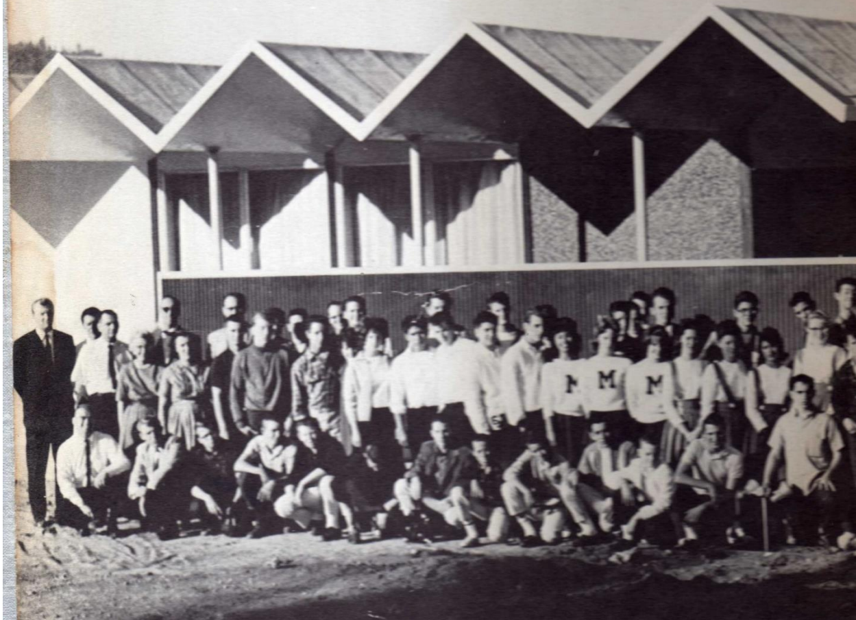
1963 The “new” Middletown Unified School

This year our Middletown Days Grand Marshal is comprised of Middletown High School graduates. Specifically, those who graduated in 1968 and prior who still live in Middletown, Cobb and Hidden Valley.