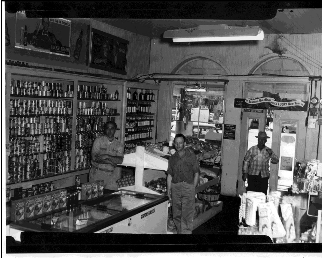
Food Center Grocery, located where the Cowpoke is today